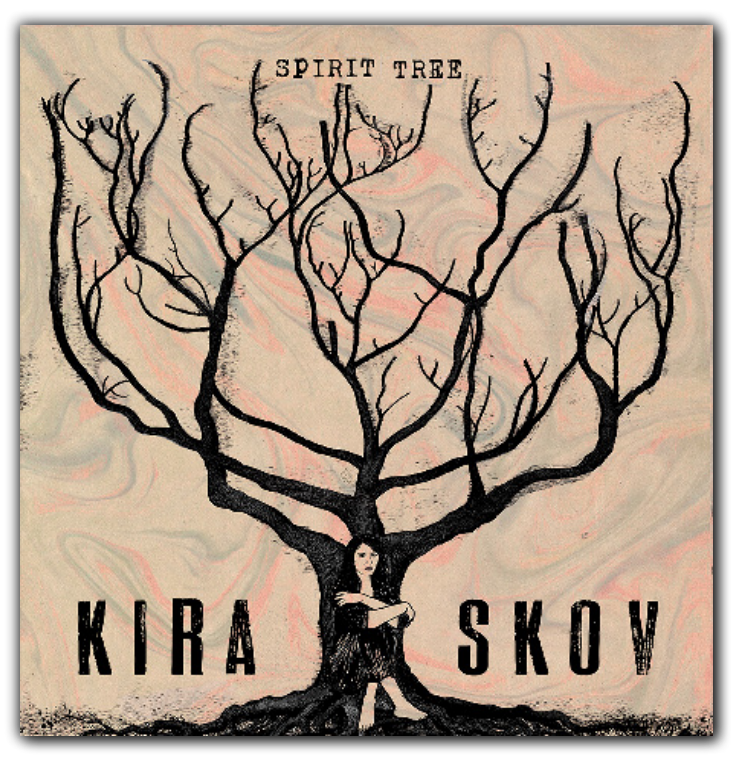
Stunt Records CD og LP